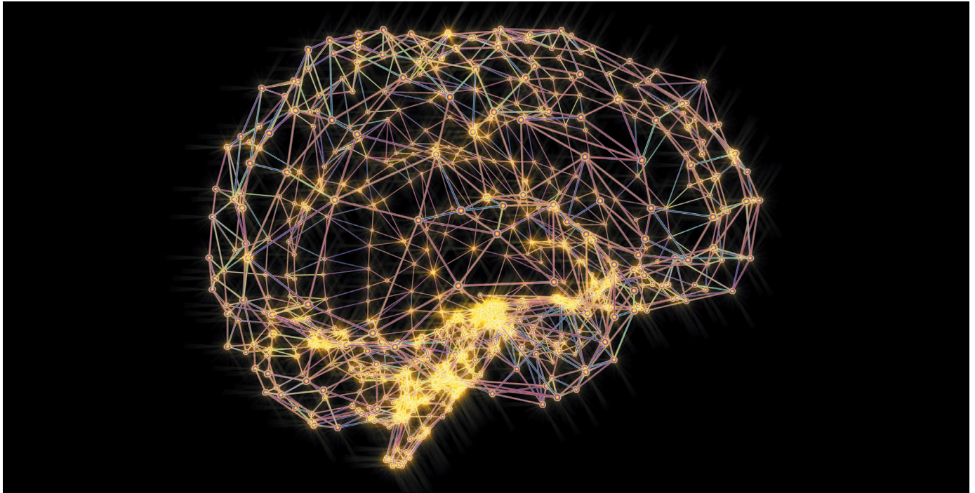
The brain's neural network has long inspired artificial-intelligence researchers.