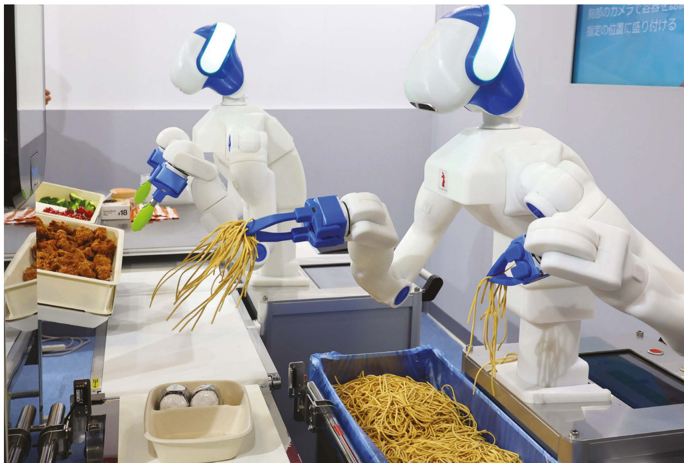
Japan's abiding love of machines gave it an early and natural advantage in robotic technology and acceptance.