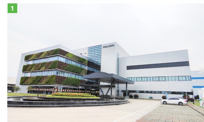
▲ 1. Haleon Suzhou Technical Center in Suzhou, China is one of the company's three R&D centres.