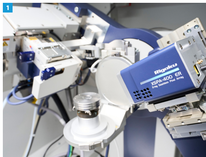
▲ 1. High-energy-resolution 2D detector and liquid battery cell installed on a SmartLab X-ray diffraction system. 2. A disordered structure obtained using the reverse Monte Carlo method. 3. An amorphous structure obtained using the reverse Monte Carlo method.

“The traditional battery testing method — electrochemical analysis — takes two to three months or more of work,” he says. “But XRD provides a material’s complete structural fingerprint