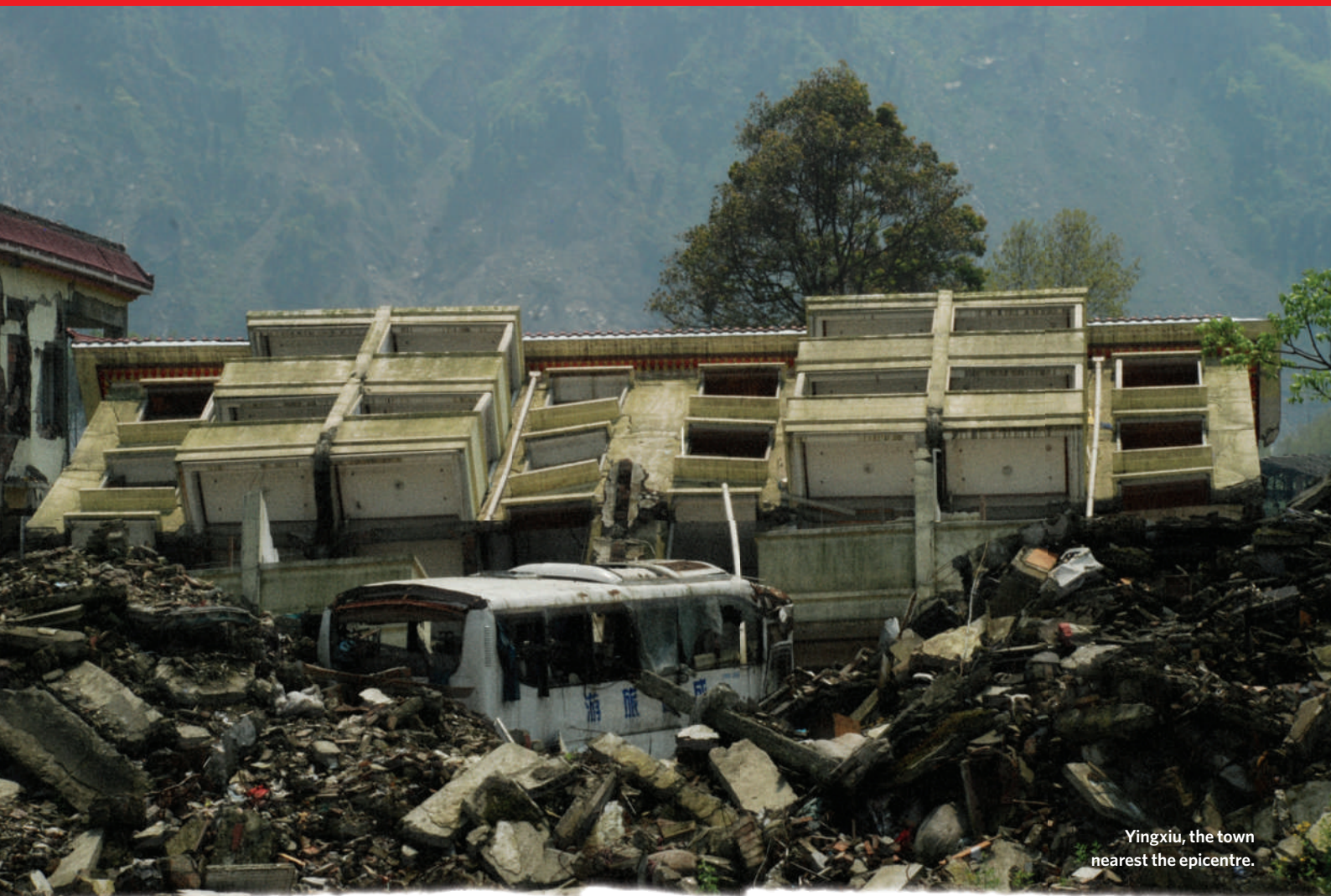
Yingxiu, the town nearest the epicentre.