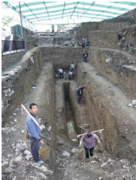
Delving into earthquake history at Bailu.

Even as construction cranes rise from town centres, the landslide-scarred mountains above tower ominously. More than one-fifth of the people who died in the quake were killed by landslides or mud flows, says Cui Peng, a geomorphologist at the Institute of Mountain Hazards and Environment in Chengdu. Precise numbers are hard to tally — the affected area sprawls over 130,000 square kilometres