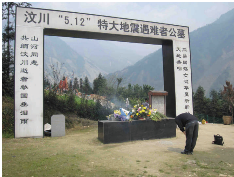
The cemetery at Yingxiu commemorates a day when most of the town's citizens died.

"This quake should play an important role in seismological history." — Liu Qiyuan